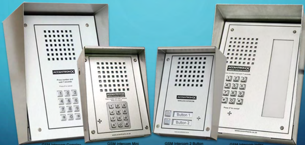
GSM Intercom Complex Size 265 x 195 x 55 mm