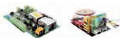
Spare control board